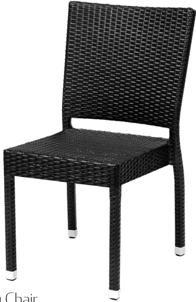
Dining Chair OD-CM-RN