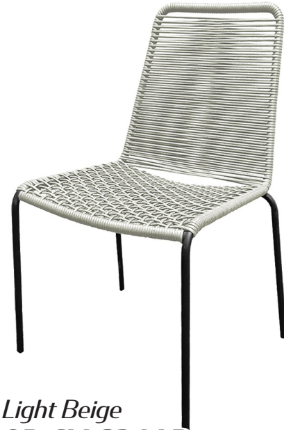
Light Beige OD-CM-834-LB